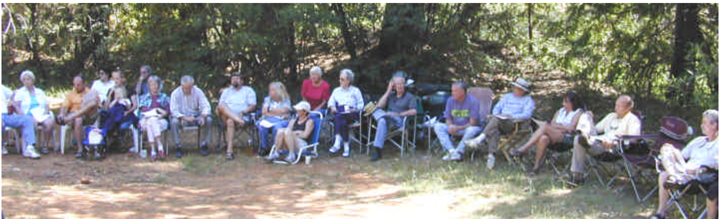
2004 Community Meeting

Forms will be sent to: EDCFSC Senior and Disabled Assistance P.O. Box 1237 Pollock Pines, CA 95726 or Fax to (530) 644-3305.